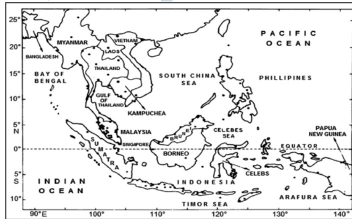
Fig. 1. Southeast Asia map [16], [17].

the south, the South China Sea to the west, and the Pacific Ocean to the east. Based on its latitude, the Philippines is a country prone to natural disasters such as hurricanes, floods, volcanic eruptions, tsunamis and landslides. This is due to its position which is heavily influenced by monsoons blowing from the Pacific Ocean towards the South China Sea [15].