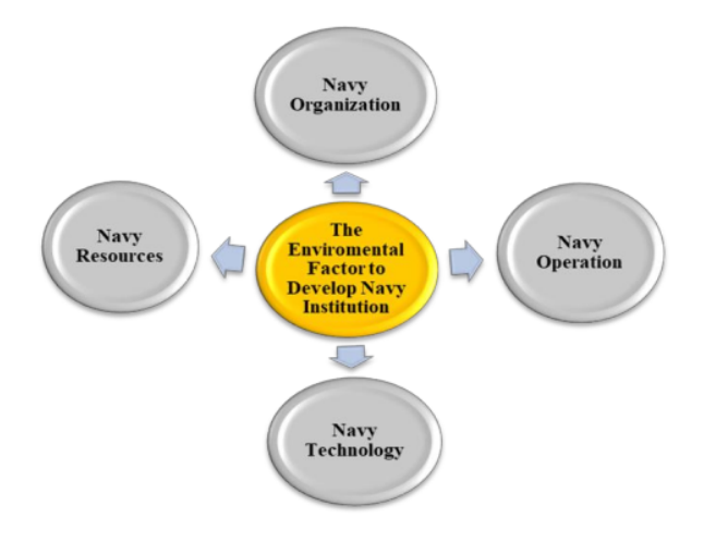
Figure 1 The Environmental Factors to Develop Navy Institution

To build a World-Class Navy, the priority is to build character, both individual characters, units and organizations of the Navy in its entirety and thoroughly. The characters needed are superior, special, and high quality or called "Excellent". Excellent in four fields, namely in the fields of Organization, Operations, Navy Resources, and Technology, as shown in Figure 1 below: