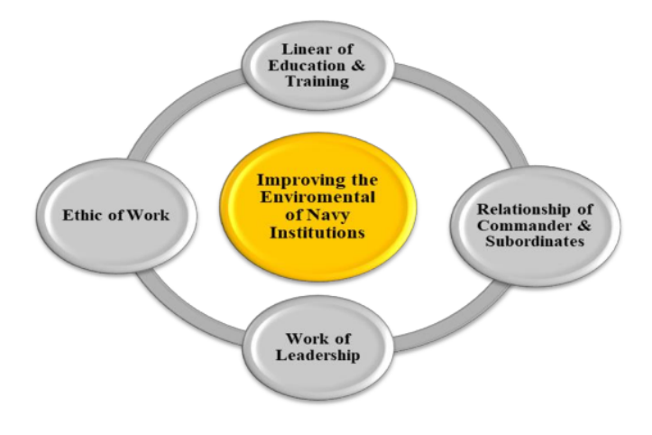
Figure 2 Improving the Environmental of Navy Resources

To be able to answer the challenges of an increasingly complex task, the Navy must be able to carry out improvements and empowerment of its Navy resources to be able to create superior and professional Navy personnel, the description can be described by some key factors as shown in Figure 2 below: